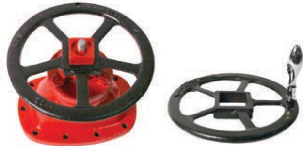
Operating nut protrudes above handlewheel